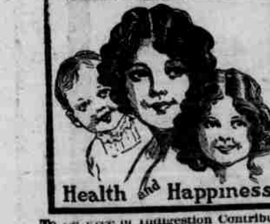
Health and Happiness

What a Relief When all the Family Eat the Same Foods! Avoid Dyspepsia, Sour Risings, Gas—Indigestion from Breakfast Sausage to Dinner Mince Pie After mother has struggled two or three hours over a hot fire to do the cooking for a hungry family, it is