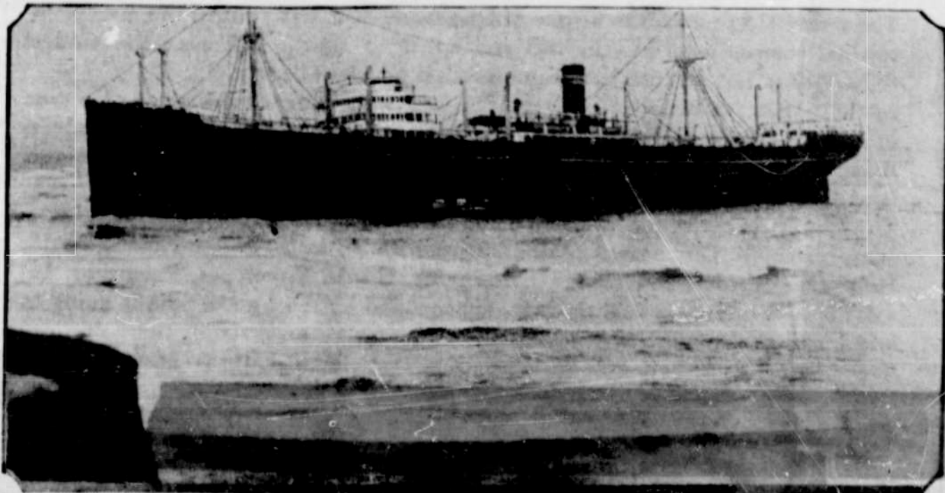
The Norwegian freighter Tal Yin ran aground on Point Reyes, Calif., while trying to make port with 12 passengers and a crew of 45.