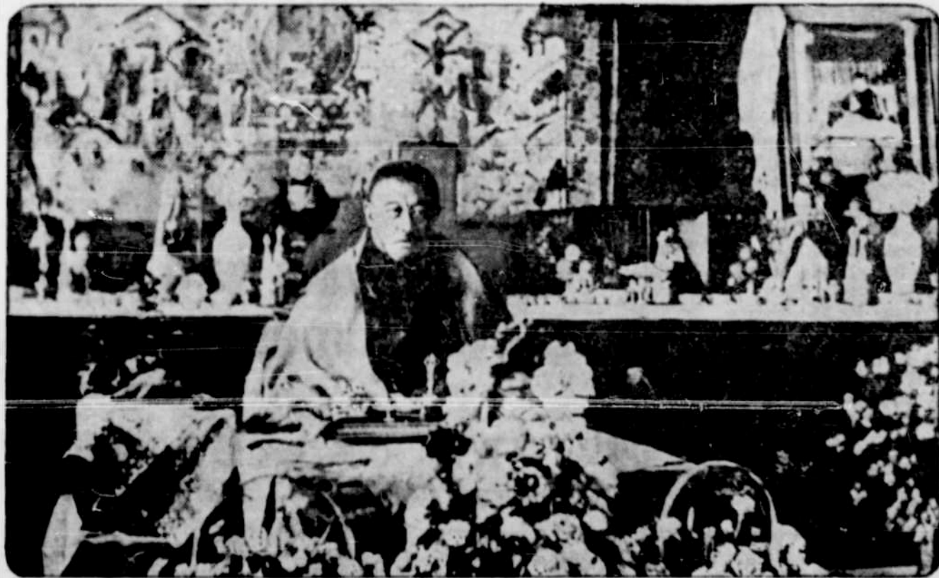
Photograph shows Panchen Lama (Living Buddha), the Cultural Commissioner for the Western Border of China, during his forty-nine days of uninterrupted prayer for the departed spirit of Dalai Lama, the Tibetan ruler, who died at Lhasa in December. The Panchen Lama, who was expelled from Tibet by the Dalai Lama in 1924, is in Nanking planning to regain his lost authority.