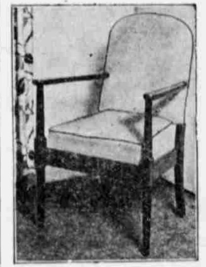
Removable Red Slip Cover for Chair.

of the room. "In making a slip cover of this kind," says the bureau, "fit the material right on the chair, wrong side up, unless there is a pronounced figure which must be centered. Mark lines for seams with pencil or tailor's chalk. Cut out the fabric with liberal allowances. Sew the cording first to the straight edge of the side strips or 'boxing,' as these strips are called; then carefully baste this strip to the front and back sections, keeping the filling or crosswise threads of the material always parallel to the floor. In