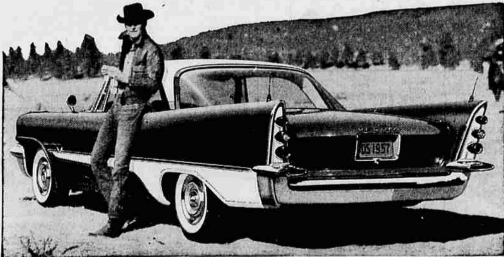
Illustrated above—295 hp Firelite 4-door Sportman

You don't need spurs with this baby! DE SOTO