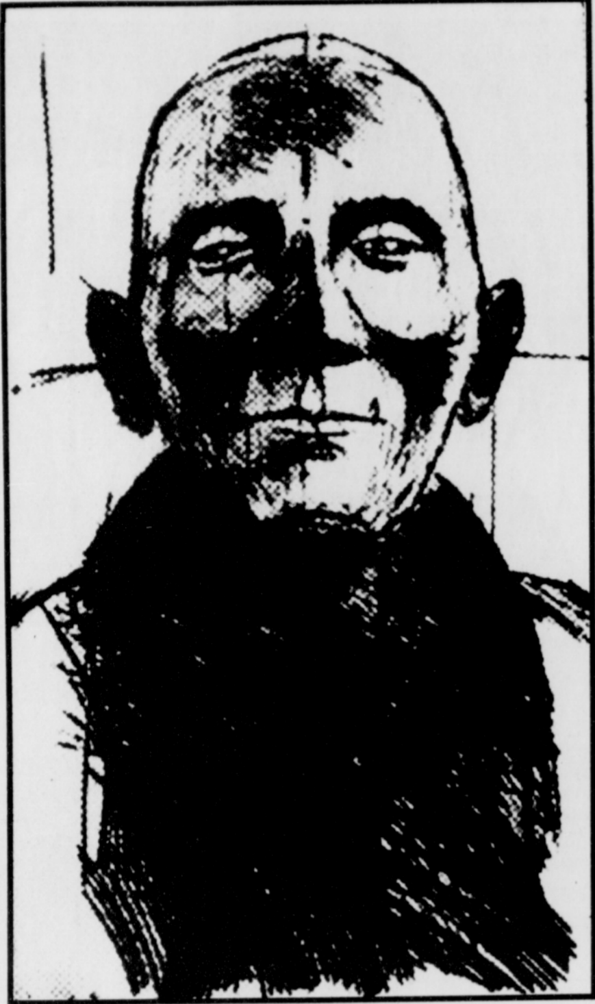
'Head of a Lotus Eater'