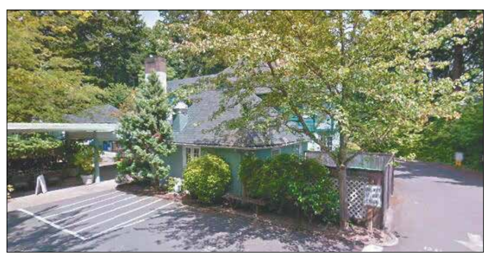
Legacy Hopewell House hospice received one of the grants from the Hillsdale Community Foundation.

The sale will be held at 3135 SE Van Water St. in Portland.